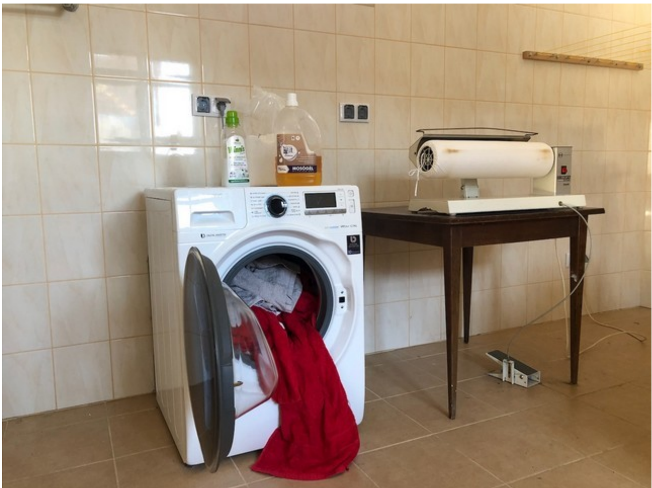
Picture 4: Washing machine using rain water and extract of washing nuts as detergent.

Irota EcoLodge consists of three physical locations: First, Irota EcoLodge itself with the three holiday homes (Lower, Middle and Upper House) and a swimming pool. The second location is the utility building in Irota where bed linen is washed and stored. On the same plot a cottage is located with a kitchen, living room and bathroom. The third location is the Budapest City Apartment: this apartment is offered in a package deal to guests of Irota EcoLodge, but also rented out separately through platforms like AirBNB. A fourth 'location' are fuels for two cars and garden maintenance equipment.