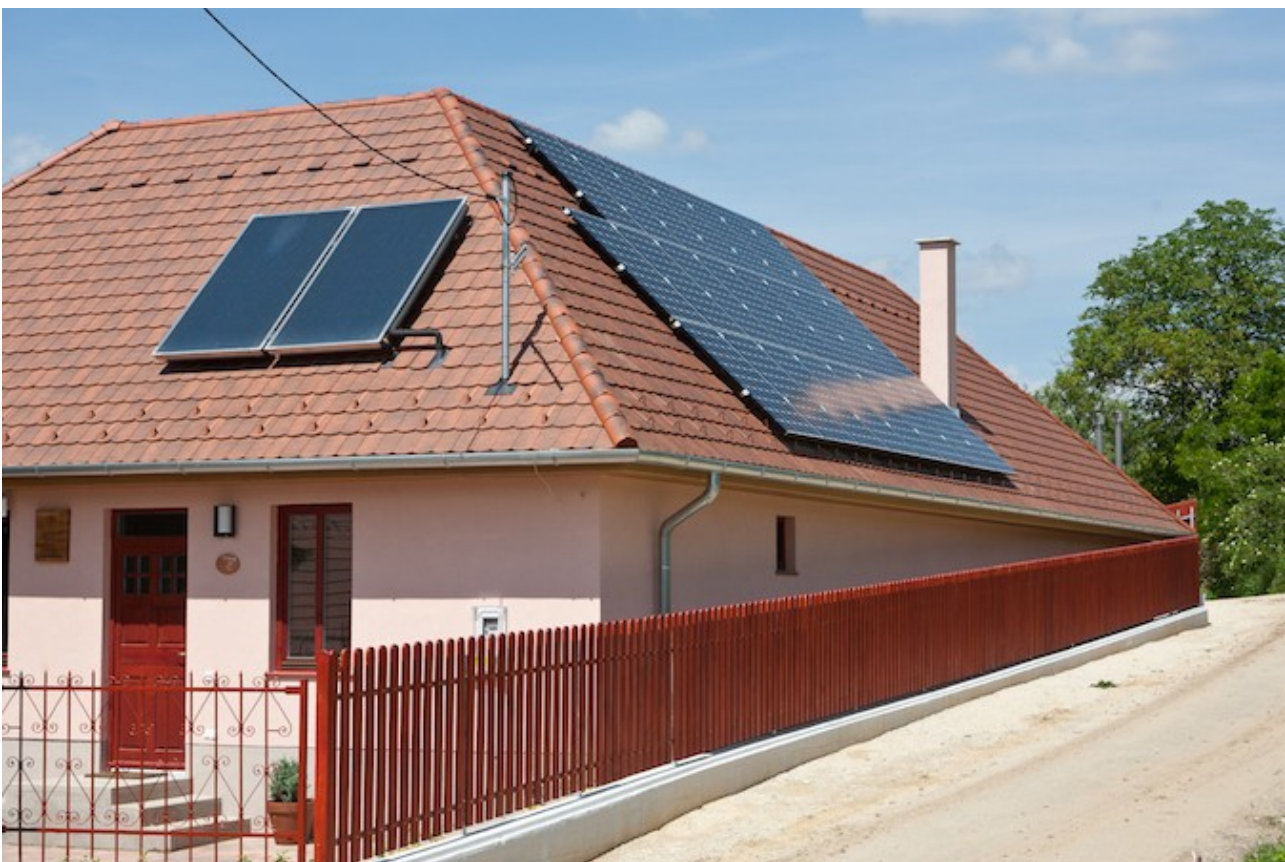
Picture 3: 6.56 kWp photovoltaic solar system (right) and solar collectors (left) at Irota EcoLodge Middle House.

Irota EcoLodge can claim to be the first and so far only climate-neutral holiday accommodation in Hungary 5 , and probably in the wider region as well.